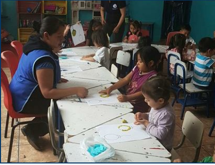
Child care program