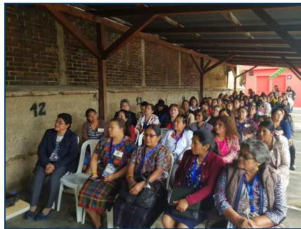
Visit to Moore Foundation