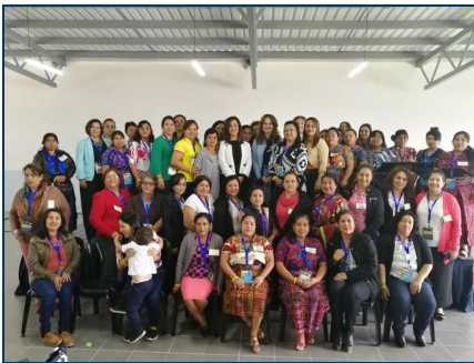
Visit to best practices