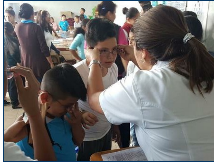
Lenses in schools