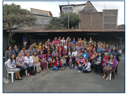
Visit to Moore Foundation