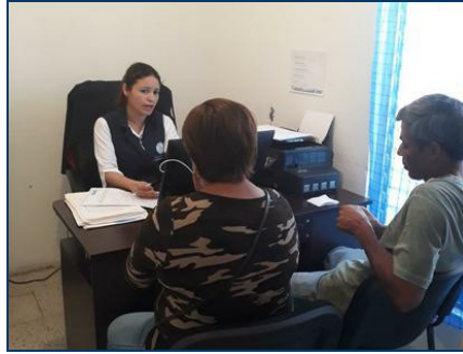
Legal and psychological counseling